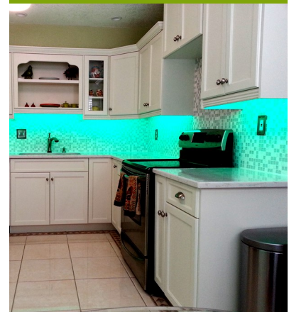
RGB LED Lighting

JMU REMODELING & CONTRACTING EXPERTS EXPERTS