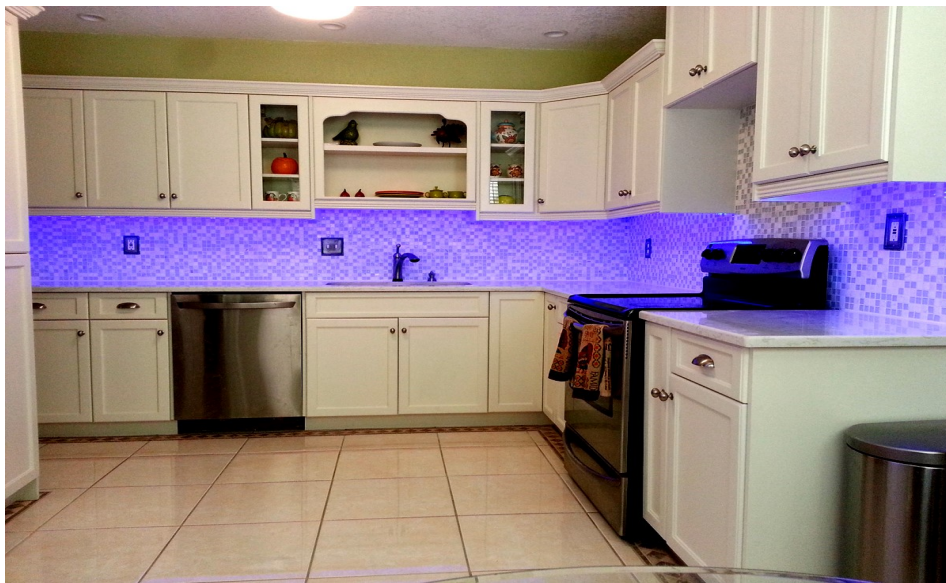
Kitchen Cabinet RGB LED Lighting